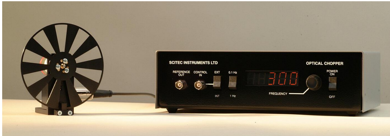
↓ Model 300CD